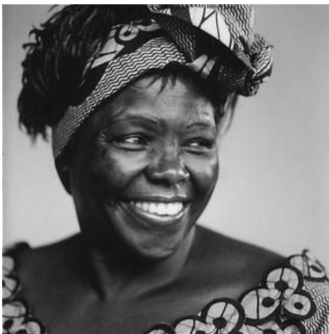
Figure 8: Prof. Wangari Muta Maathai, after whom the Impact Award is named

Professor Wangari Muta Maathai, Africa's first female Nobel Laureate, is internationally recognised for her contributions to democracy, peace and sustainable development in Kenya and across the greater African collective. Born in rural Kenya, she was the first woman to earn both at the University of Nairobi, a doctorate degree and to be appointed to associate professor.